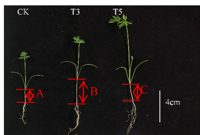
Fig. 1: Carrot seedlings on day 20 of hormone treatment Note: A, B, and C indicate the stem length of CK, GA 3 , and IAA, respectively

Note: Data were analyzed using the LSD multiple comparison test implemented in DPS7.5. Different letters indicate significant differences ( p < 0.05 )